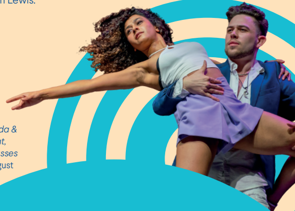
Salsa classes on 18 August

Share your Summer with us! #NorwichSummerSessions #CityofStories @NorwichBIDUK @VisitNorwich norwichsummersessions.co.uk