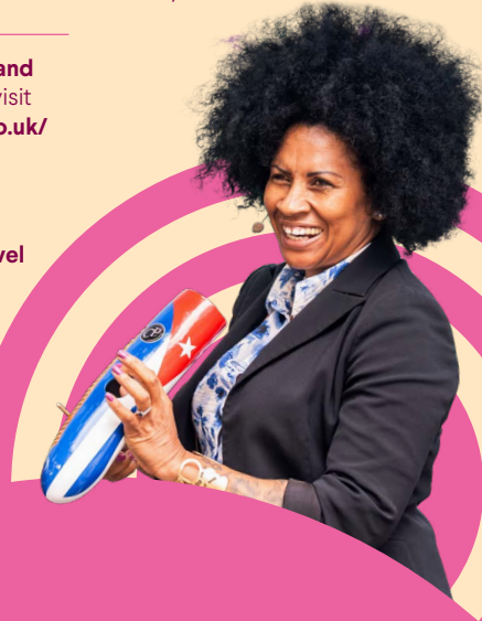
Image: Sarabanda & Norwich Latin Dance on 31 August