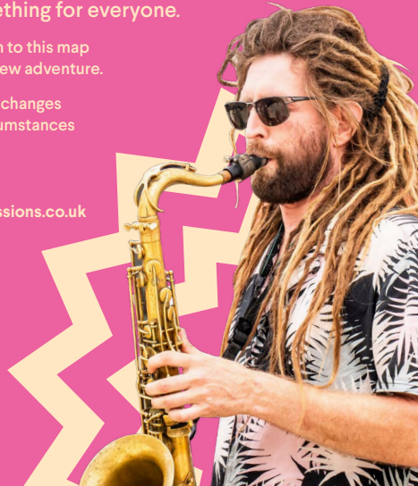
Image: Nebula Sun , playing live on 17 July

»» norwichsummersessions.co.uk @NorwichBIDUK @VisitNorwich @visit_norwich